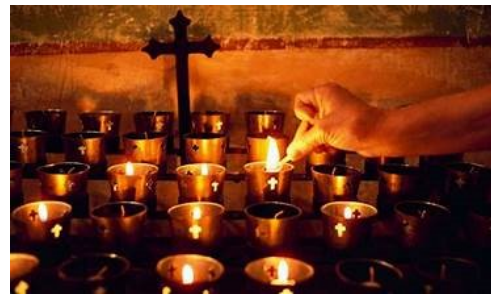
St. Gertrude Prayer

Like the seed buried in the ground, you have produced the harvest of eternal life for us; make us always dead to sin and alive to God. Amen.